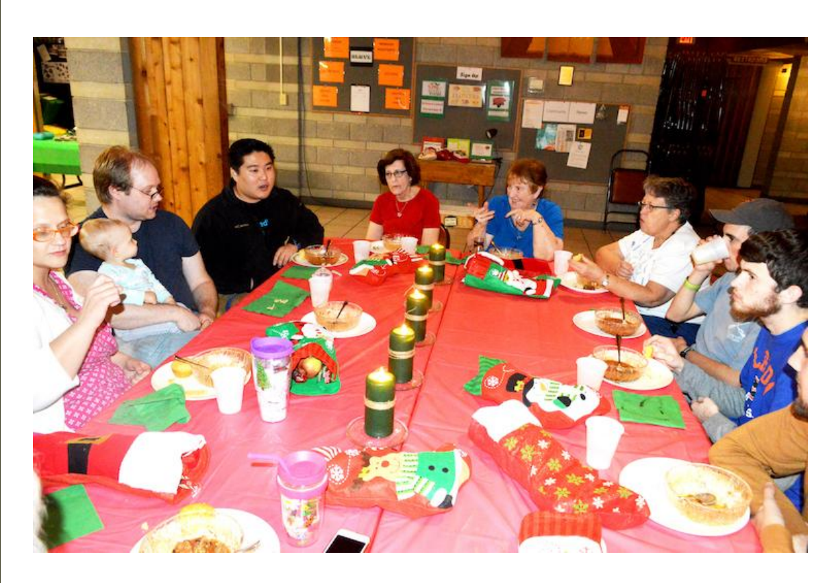
Thank you to the Hospitality Action Team for the Fall Term Student Survival Dinner!