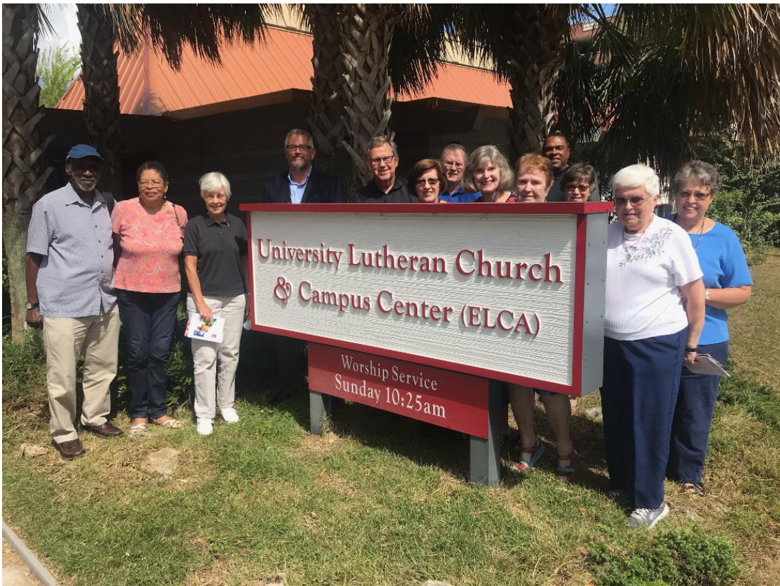
Young Adult Ministry